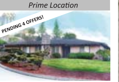
326 Lowell Lane East | Lafayette 4 Bedroom, 2 Bath, 2000± Sq. Ft. Offered at $1,149,000